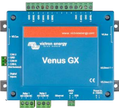
Venus GX with connectors