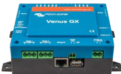
Venus GX front angle